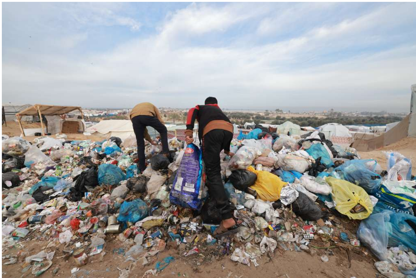
Photo: People in Rafah search through rubbish for food or other salvageable items