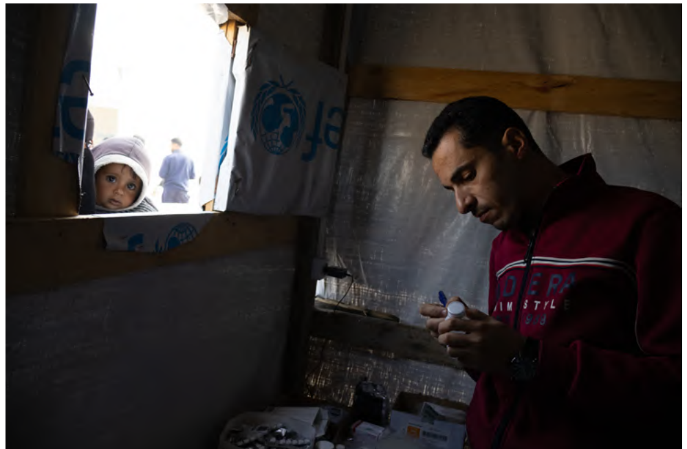
Photos: Left. MSF staff member in Al-Mawasi temporary primary healthcare centre. Right. MSF's Al-Mawasi temporary primary healthcare centre in Rafah opened in January 2024